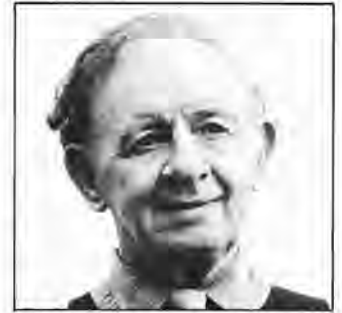
by DOUG MOSS

Conference agreed re-numbering of Divisions so that First Divisions follow those of Premier status. It is hoped this will allow publication of more results in national Press and on Teletext, as was achieved for Senior Premier Division last season.