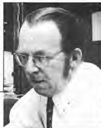
George Yates continues as General Secretary of the European Table Tennis Union